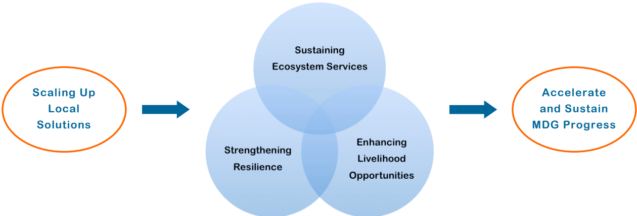
Figure 1 | Scaling up nature-based solutions to achieve the MDGs

This working paper sets out a framework for action to bring about such an effort. Its thesis is that local actors are the most effective drivers of change at the local level, and that empowering local organizations to carry out their own initiatives is the starting point for local solutions to poverty and environment challenges.